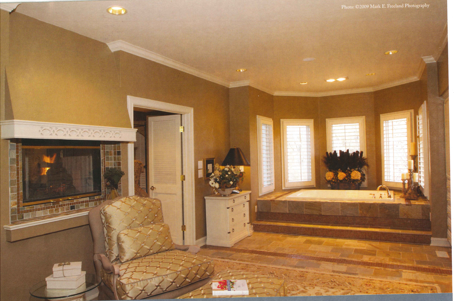
The outdated look of this master suite was transformed with extensive tile work and color changes. 2 x 2 slate with gold glass inserts was chosen to surround both sides of the see-thru fireplace that connects with the master bedroom. Larger pieces of the same slate and bands of gold glass were also used in a modular pattern for the floor and tub deck.

The tradition of craftsmanship and quality lives on in the central Indiana homes where Gene Snodgrass has left his mark.